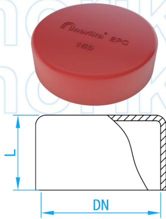
CROSS SECTIONAL VIEW